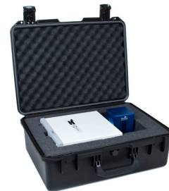
MPX-2 in Carrying Case (Optional)