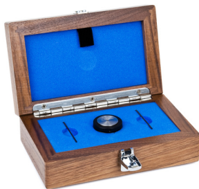
MPX Geometrical Calibration Artefact (Optional)